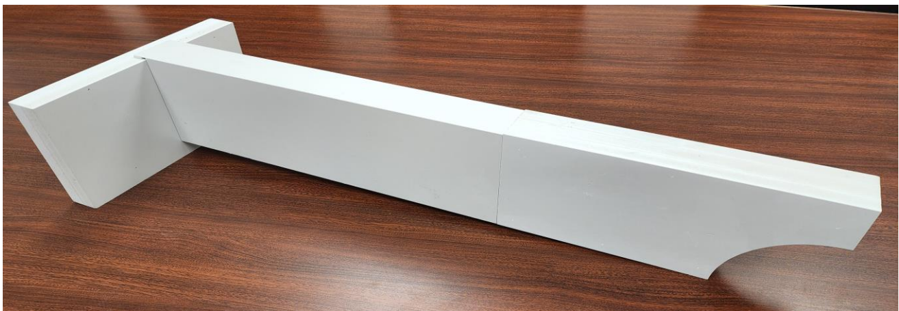
Quick Connect Ledger Board